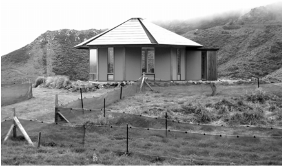
The wind breaks around the newly planted trees.

This spring at Christ College we planted over 2000 trees around the meditation temple and Long Bay House. We were blessed in every way as we did this work.