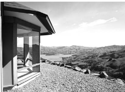
The Silent Space- Open to All Visitors.

During the summer, come and meet them and become friends with the trees. They will be the guardians of this space.