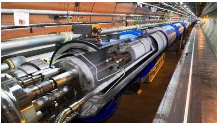
Large Hadron Collider – Cern

What will the transits of 2012 bring in the decades to come? We've already seen huge changes since the previous transit in 2004. One can only imagine but can speculate it would highlight relationships of all kind, between individuals, groups, nations, encouraging the note of brotherhood and the interconnectedness on all levels through consciousness. Will there emerge a new and improved financial system? Will there be an empowering of the United Nations? Will there be a move towards sustainable energy around the world and a decline in our addiction to oil? Will the nature of the etheric body be scientifically proved? Will the nature of the soul be scientifically proved? Will the recent discovery of the Higgs-Boson or 'God particle' lead on to greater discoveries in quantum physics which open up our understanding of the underlying principles of matter? Will the principles of democracy continue to emerge in places like Burma and the Arab world?