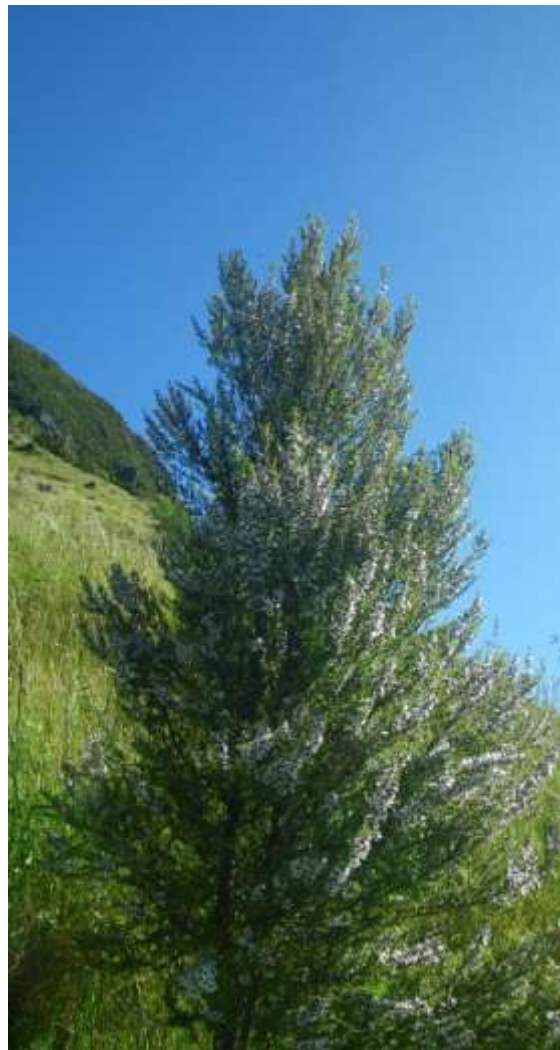
Manuka – Christ College Xmas Tree