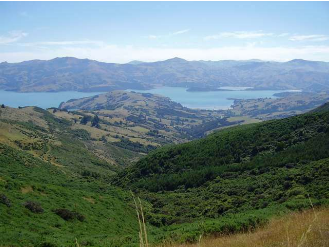
View from land

MORE PICTURES ON WWW.CRTREALESTATE.CO.NZ LISTED AS TU7678