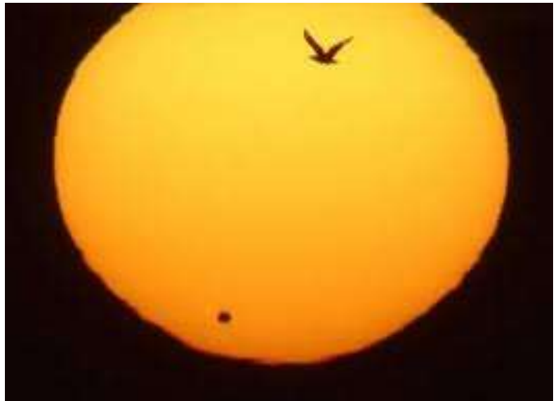
Venus Transiting the Sun

The Royal Society of England tasked Cook with this mission. His ulterior secret mission given by the Society was to discover Terra Australis Incognita, the great southern continent that was thought to balance the land mass of the northern hemisphere. In the process he discovered and mapped the outline of Aotearoa and observed the local people, flora and fauna along with the botanist Joseph Banks. They were aided along the way by Tupaea, a Tahitian Arioi (chief), a learned man who helped them navigate the Pacific who had a breadth of knowledge of the Pacific region, even though he had physically only been to a few islands himself.