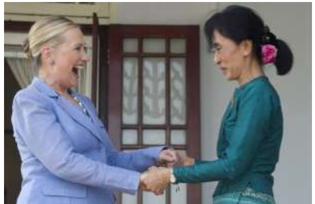
Hillary Clinton and Aung Sun Suu Kyi

All of these are possibilities in the next few decades, but in general one can imagine new ideas being impressed on humanity and thereby stimulating the true potential of our birthright; that we are each essentially free, conscious beings, capable of far more than we currently can see. It is only the limited thought-forms, ignorance of the many different levels of consciousness, the focus on things emanating from matter or the brain rather than consciousness, and the illusion of separateness that blinds us. Venus also represents inclusivity of both ideas and in relationships.